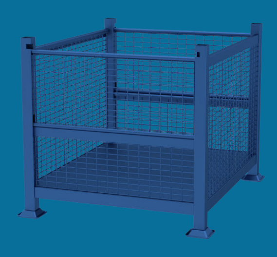
Standard Blue Enamel Finish