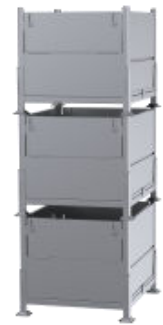
STACKED 3 HIGH FOR TRUCK SHIPMENT