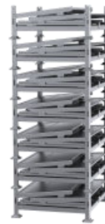
STACKED 7 HIGH FOR TRUCK SHIPMENT